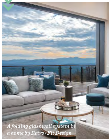
A folding glass wall system in a home by Retro+Fit Design

Flexible doors. Like a retractable wall eliminating the barriers between the indoors and outdoors, floor-to-ceiling bifold or sliding doors add an expansive feeling to any space. This is an ideal way to bring the outdoors in and allow fresh air to circulate.