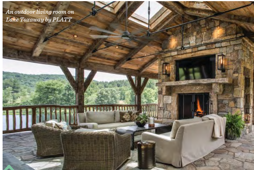
An outdoor living room on Lake Toxaway by PLATT

T he past year has brought lifestyle updates to many, and those changes are reflected in home building and renovation developments. Concerns that may have seemed temporary are likely to be with us for a long time, and possibly change home design for years to come. Here's a look at some of the home trends taking hold around WNC.