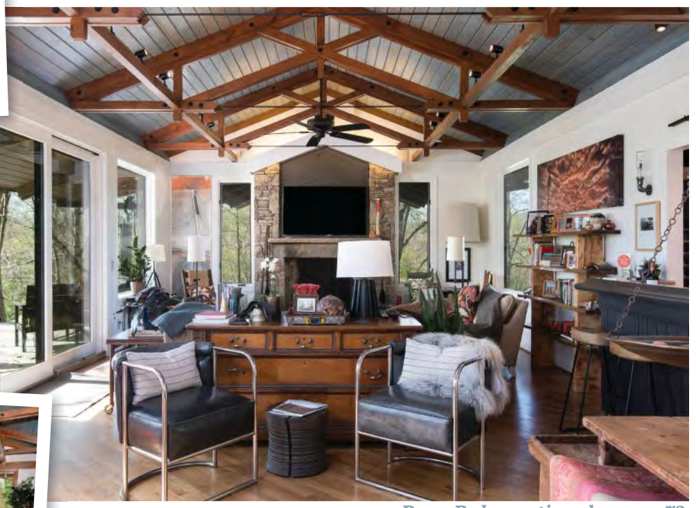
Room Redos continued on page 72

LIVING LARGE In the living room (above) and den, Platt painted everything white, updated the lighting with modern fixtures, added track lighting, and removed the curtains. His taste in eclectic art and furnishings enhances the look.