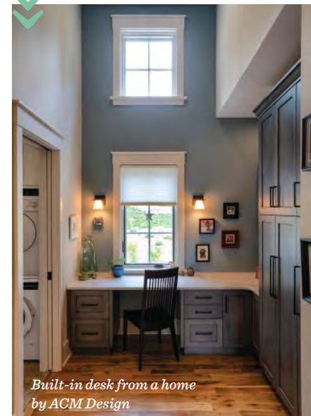
Built-in desk from a home by ACM Design

Home office. The home office is nothing new, but in the past year, there's no denying that it has taken a new meaning. While the home office can mean anything from a dedicated room to a built-in desk in the kitchen, increasingly there's a demand for purpose-built exterior offices on a home property.