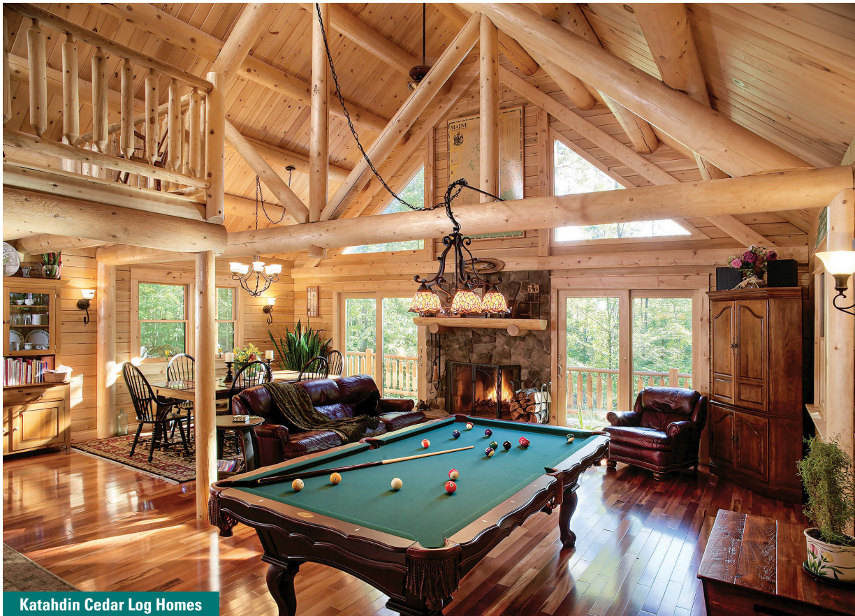
Katahdin Cedar Log Homes