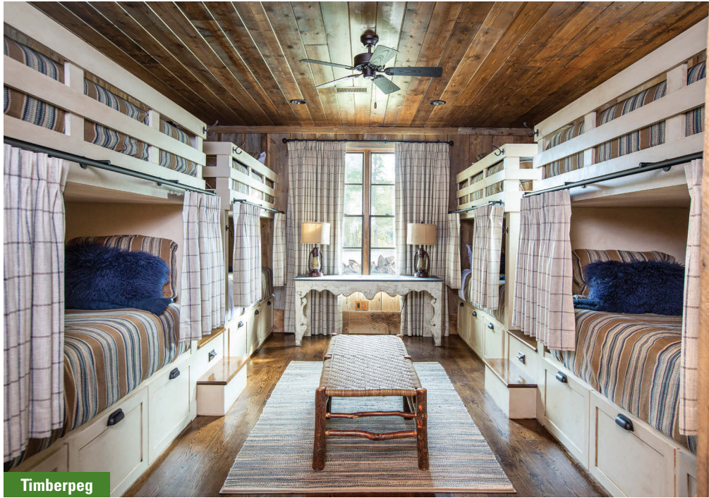
above right Bunk beds get a grown-up spin in this hunting lodge, where more really is merrier. The reclaimed barnwood walls and a white pine ceiling create a rustic backdrop for crisp white custom bunks. Thoughtful touches like individual curtains, storage drawers under each bed and stairs to the top bunk make for a comfortable stay for all.

Photo by Beth Hall Photography; Courtesy of TIMBERPEG®; PLATT Architecture; Cline Construction