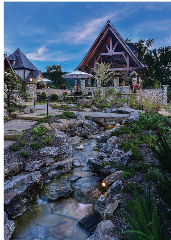
Water features enliven grottoes and custom stonework lends a stately rusticity.

elements. And, should heat and humidity spike, there's a misting system.