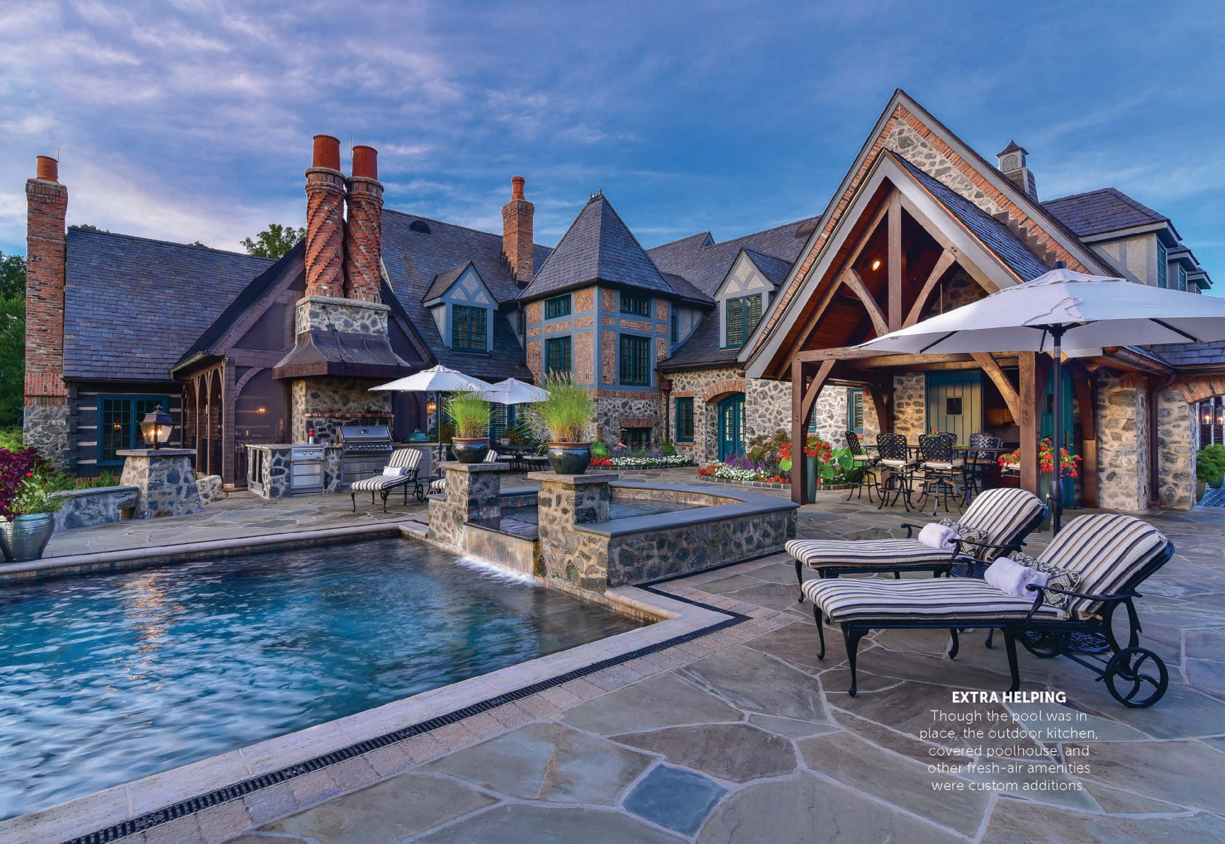
EXTRA HELPING Though the pool was in place, the outdoor kitchen, covered poolhouse, and other fresh-air amenities were custom additions.