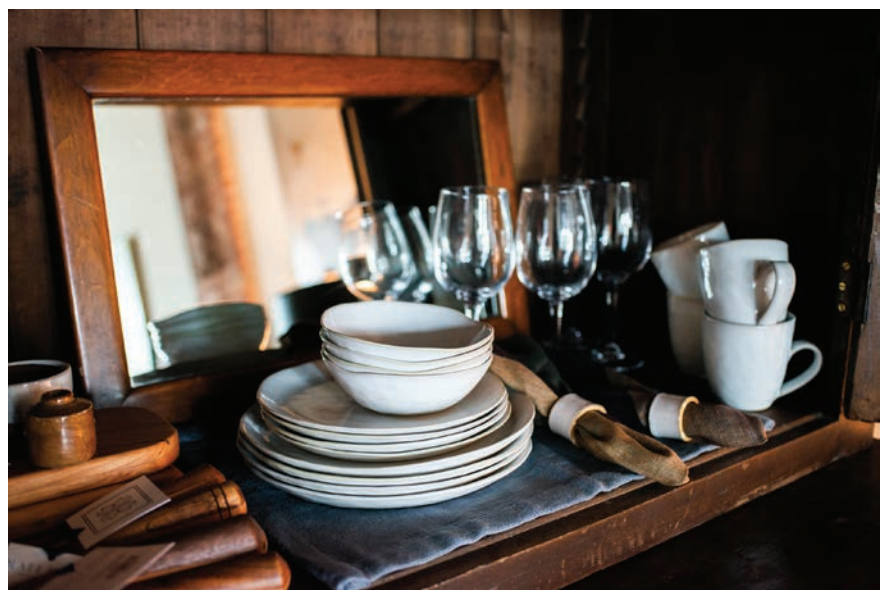
Merchandise ranges from small decorative items to major artistic and architectural installations.

back loads of interesting things, like Argentinian textiles, African hats and beads, and custom knives from Germany,” she shares. “We’re also proud to carry fine art by local and regional artists, and showcase artwork from The Haen Gallery [located in Asheville and Brevard].”