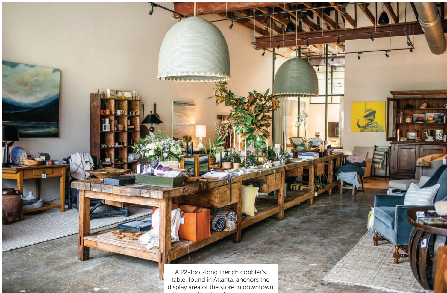
A 22-foot-long French cobbler's table, found in Atlanta, anchors the display area of the store in downtown Brevard. Merchandise comes from around the region and around the world (for example the custom German knives at bottom right).